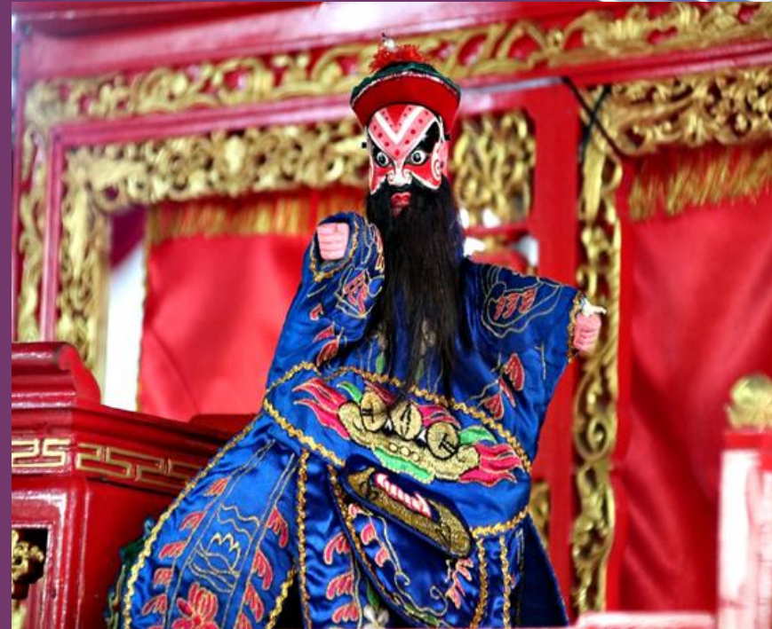
The potehi puppet performance of Shi Jin Kwie