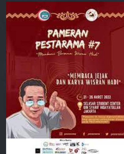
Pekan Apresiasi Sastra dan Drama