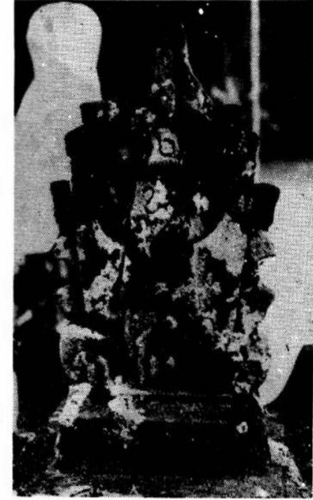
Gravestone/Nisan in Banyusumurup Complex, Imogiri