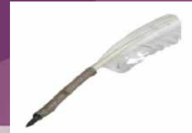
(Doc. By myself)