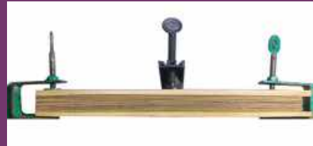
(Doc. By myself)