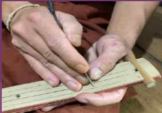
(Doc. By myself)