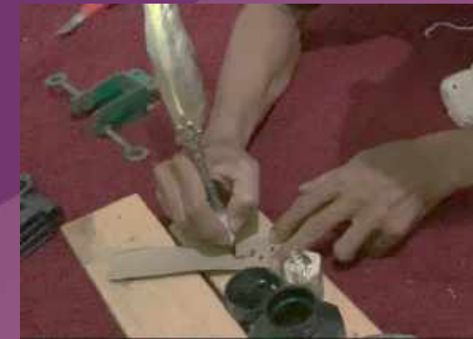
(Doc. By myself)